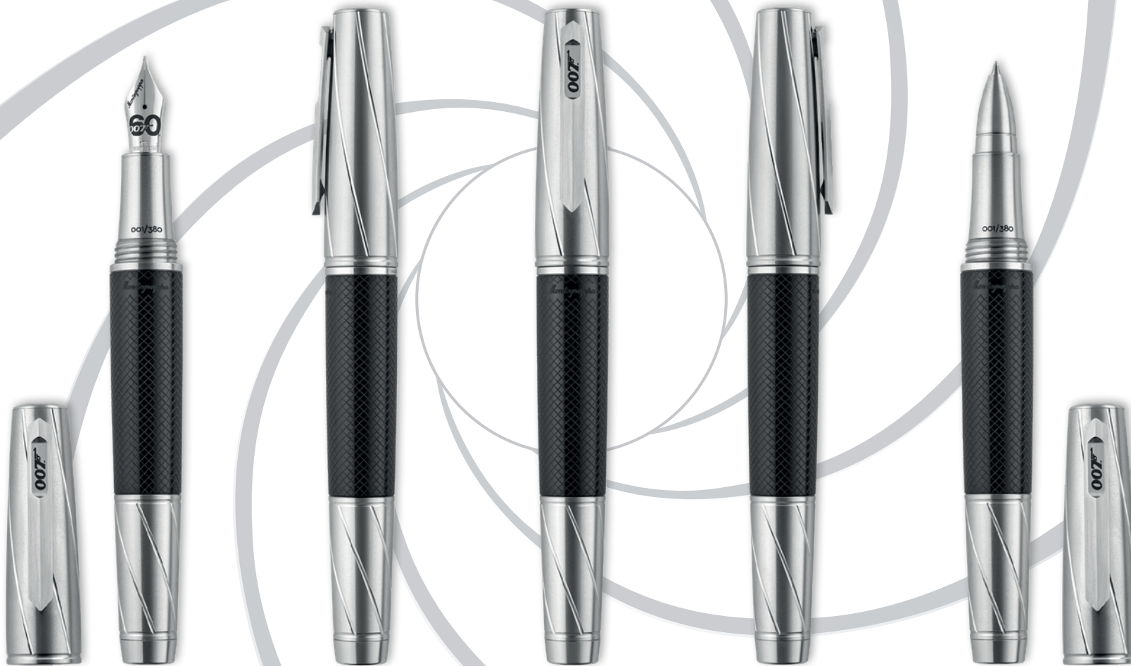
ISBJN_IC FOUNTAIN PEN